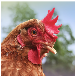
Ginny - April 2022