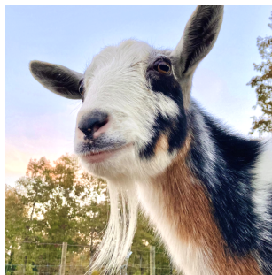
Skittles - April 2022