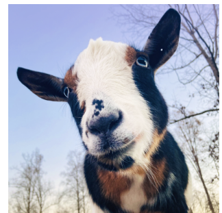
Spice - April 2022