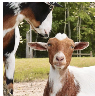
Sugar - April 2022