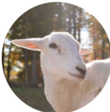
Wilma - October 2021