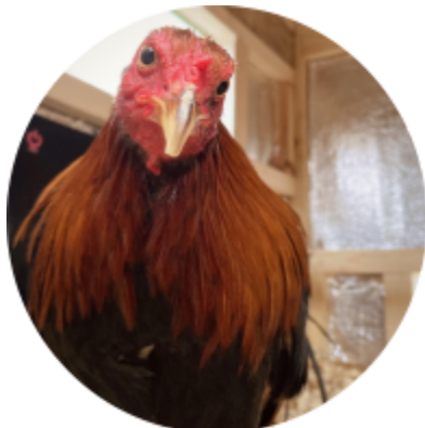
Barbosa - November 2021