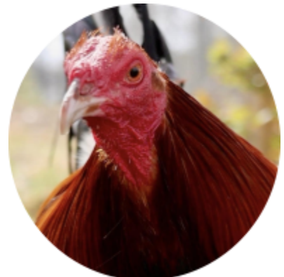
Morgan - December 2021