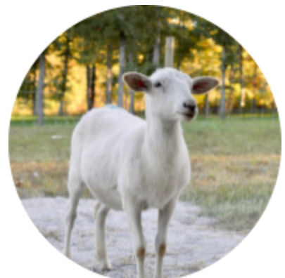
Pearl - October 2021