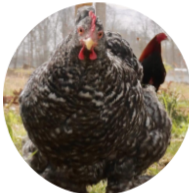
Tillie - December 2021